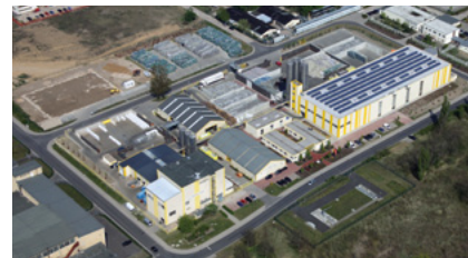
Polyester recycling plant in Germany