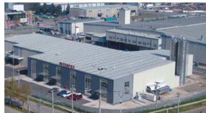
Productions centre for STARstrap™ strapping in Chile