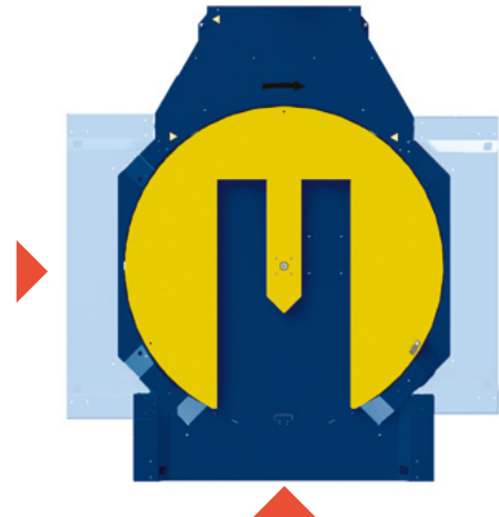
Horseshoe turntable with 3 in feed