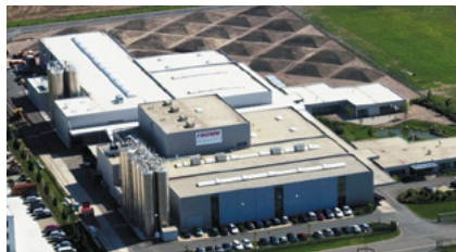
Productions centre for STARstrap™ strapping in Germany